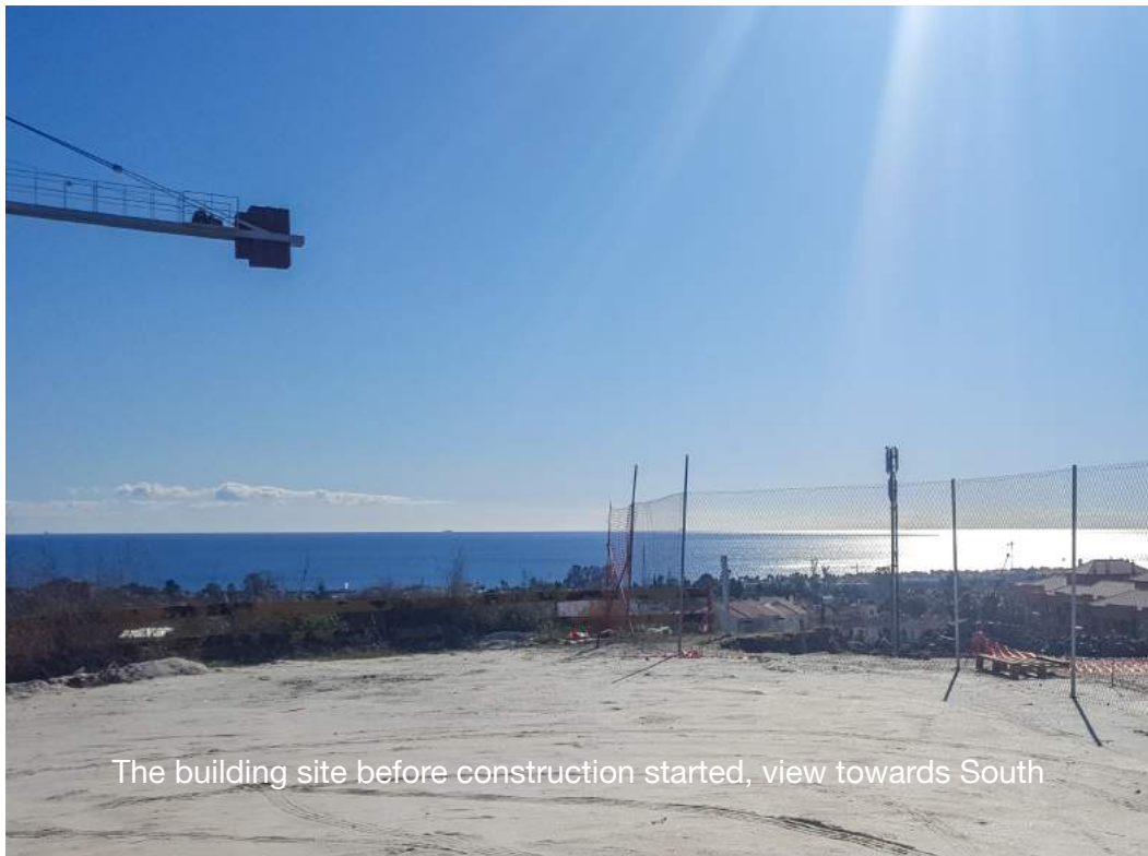
The building site before construction started, view towards South

Villa #4 is almost fully designed and will have five bedrooms with corresponding bathrooms. The master bedroom suite with its large bathroom, a walk-in closet is beautifully located on the top floor with panoramic sea views and a spacious south facing private terrace.