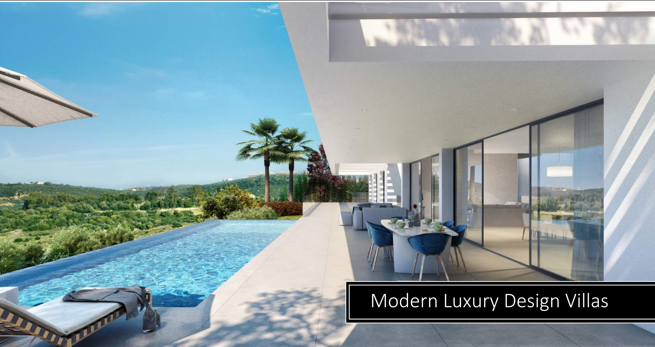
Modern Luxury Design Villas