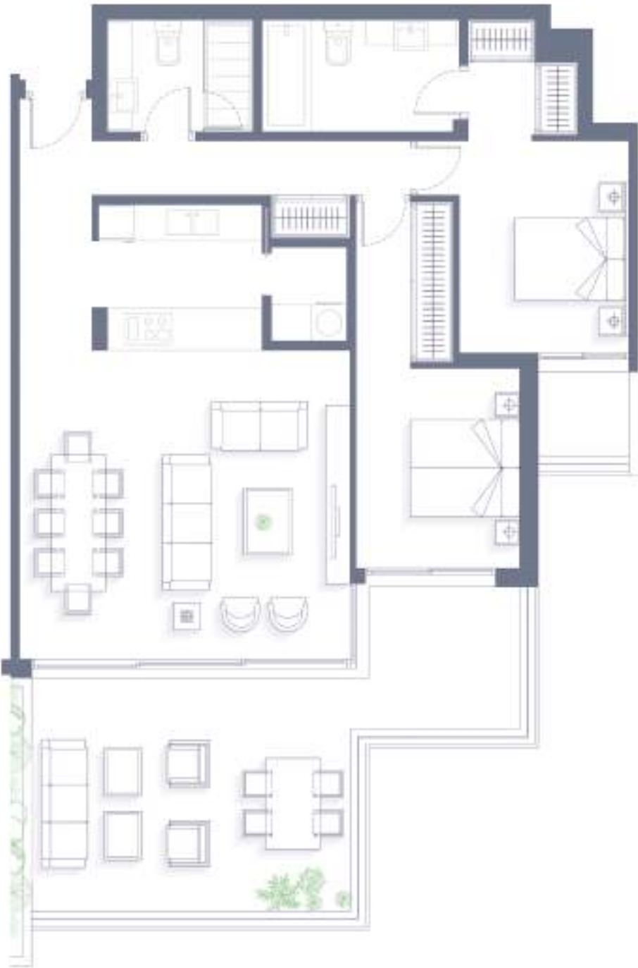
FLOOR PLAN TYPE 1: 2 BEDROOMS 2 BATHROOMS

Usable interior area Usable exterior area