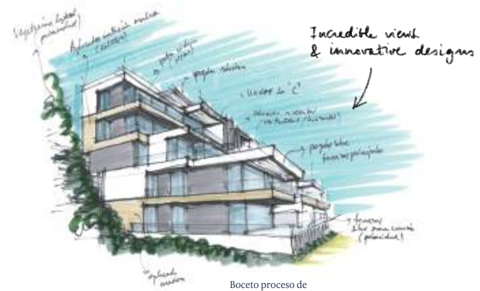
Boceto proceso de Maiz & Diaz Arquitectos

Avant-garde and elegant in design South Bay transcends the boundaries of traditional architecture to offer a new lifestyle concept in urban living by combining top quality materials with bold new inspirational designs , large bright living spaces fluidly connected to oversized terraces with unbeatable sea views over the town to Gibraltar and the North African coastline .