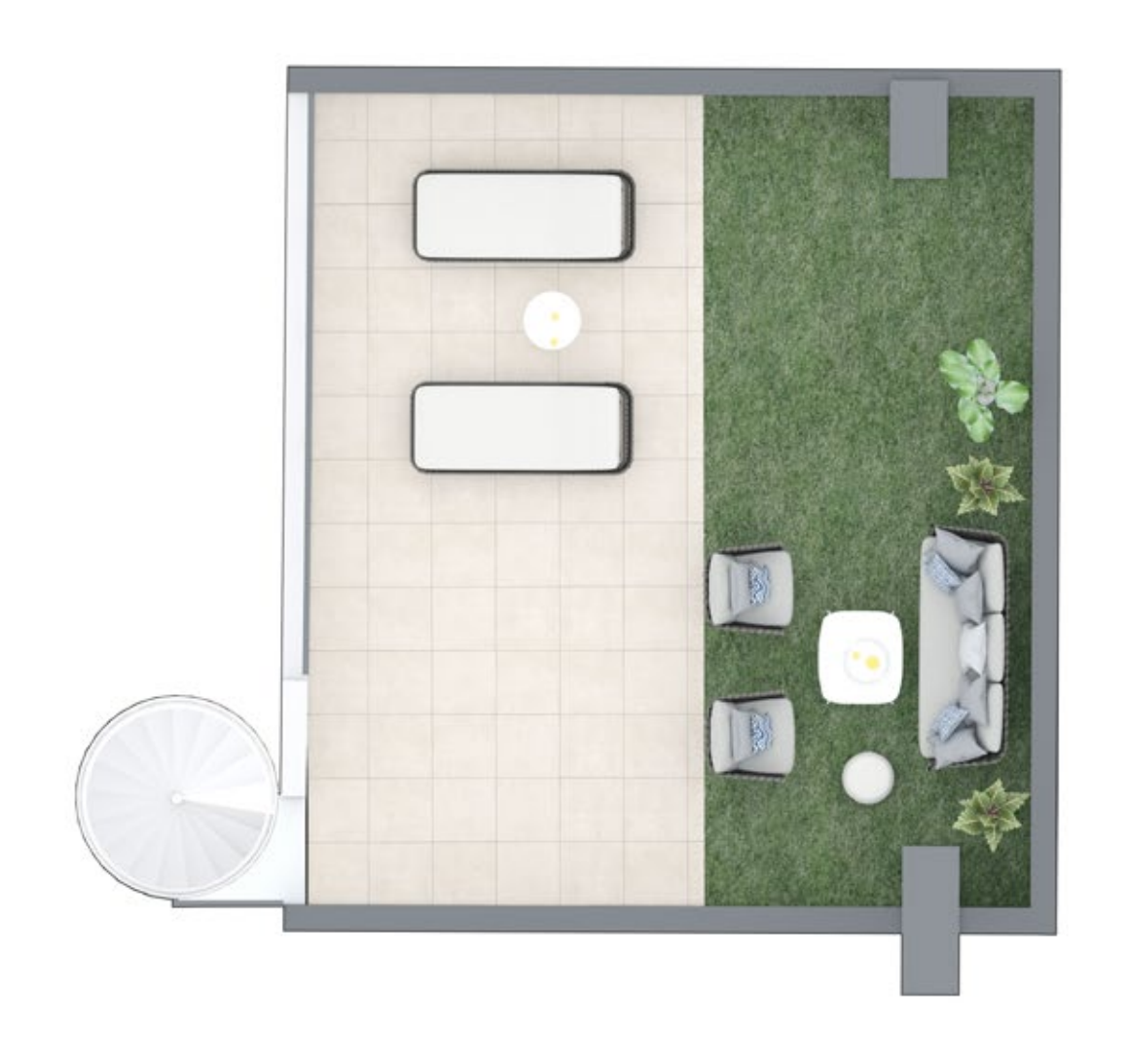
SOLARIUM - 2 BEDROOM LAYOUT