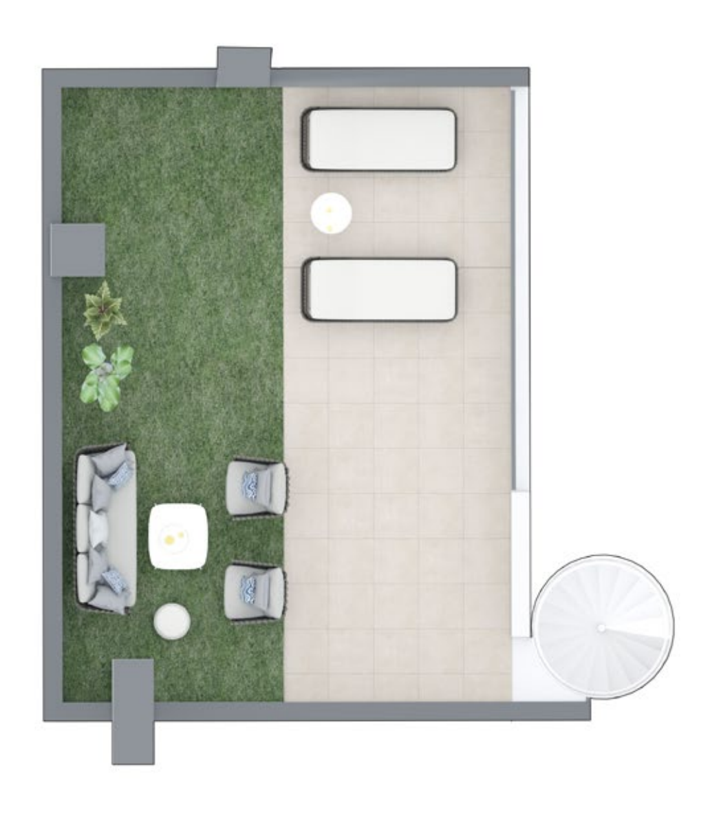
SOLARIUM - 3 BEDROOM LAYOUT