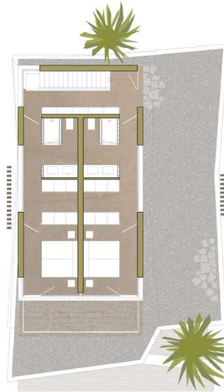
UPPER FLOOR / PLANTA ALTA